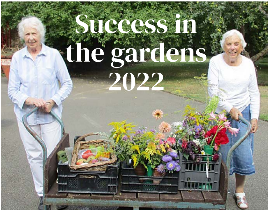
Volunteers prepare to exhibit the fruits and flowers from the Gardens at two local shows.